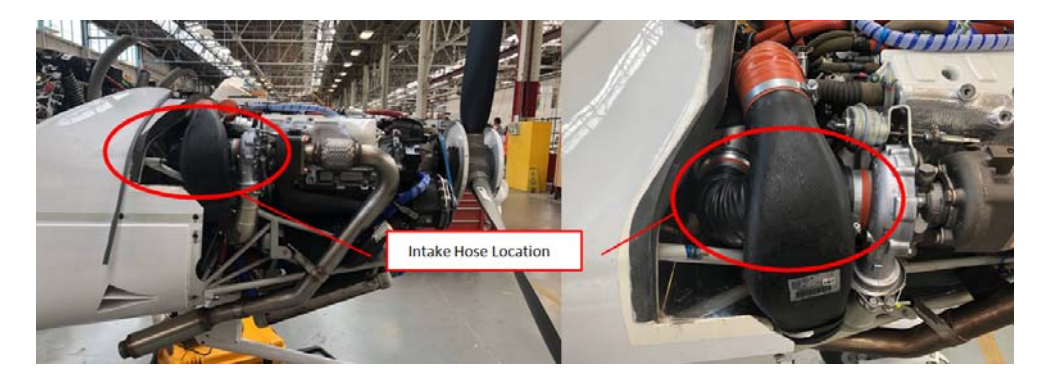
Figure 2: Intake Hose Location in DA 40NG Aircraft

1.4.2 Customers are advised to confirm the correct part is installed on their DA 40NG aircraft. The hose is installed in the air intake system between the alternate air valve and the turbocharger. Note the hose may be covered by a black chafe protector. Location of the hose is shown in Figure 2 below.